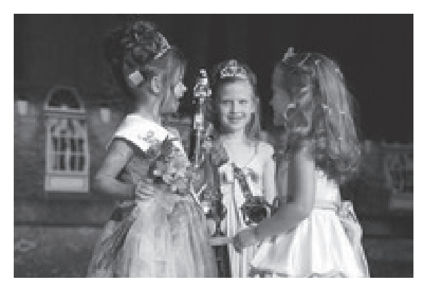
Hermon Rec sponsors "Little Miss Hermon" pageant...