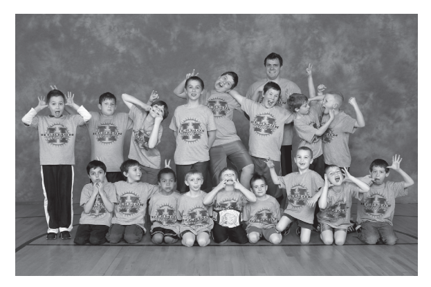
Rec Youth Wrestling Team 2011...

Funds derived from the several different recreational programs have benefited our residents in many ways. We have completed groundwork projects in 2011-2012 for the school and community including baseball/softball field improvements in parking, fencing and pitching warm-up areas. There were several safety items completed at the Community playground including installation of new engineered wood fiber to decrease the occurrence of injuries. Parking lot improvements for safety included striping the HES lot so parking can be managed in an orderly way for Recreational events, School and public items such as Municipal voting. The Hermon School department contributed and supported both of these major projects this past cycle with funding as we worked together to address both items.