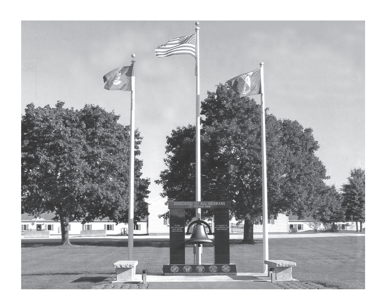
To the men, women and families who have served, thank you for your sacrifice. We honor your service.