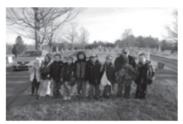
Hermon Scout Pack 25 place Veteran's wreaths...

The regularly scheduled town events such as the Halloween Party and the "Spring Time" Celebration will continue. This past year's events have been well attended and supported by residents, community groups, interested parent volunteers and educators in our town. Hermon School Elementary Teachers dressed as Halloween figures and helped celebrate the day by participating with students who attended the event!