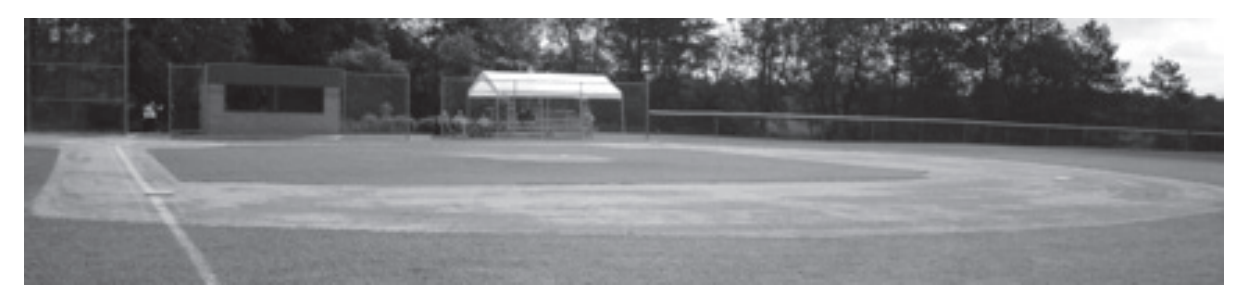
Hermon Little League field on Billings Road...

Our department also assists in Town parties, public events and community run programs such as Little League baseball, Wreaths Across America and Hermon's 2014 Bicentennial planning committee leadership.