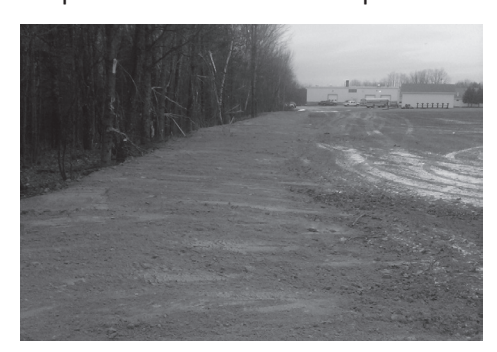
Trail connection from HMS to HHS...

Public works will assist with the cemetery expansion project in Spring of 2013 at Snow's Corner to keep costs as reasonable as possible. The expansion project will alleviate a shortage of burial plots,