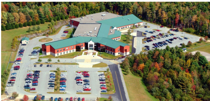
To prepare students for personal success in college, work and community

The ideas expressed in this editorial are part of a pilot program that has been presented as part of the 2017-2018 Municipal budget.