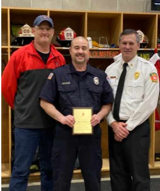
Pictured above left to right are: