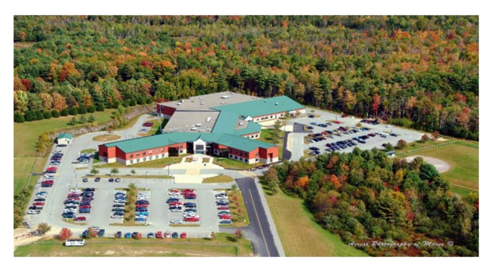
Hermon High School