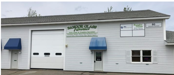
Bangor Glass & Graphics

Visit this Hermon business for you lettering or glass replacement needs today!