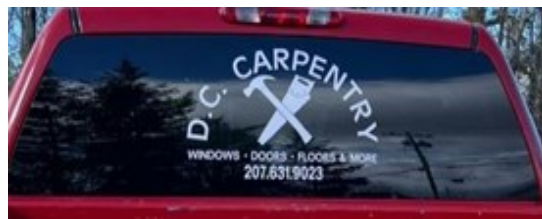
Vehicle lettering by Bangor Glass & Graphics

60 Freedom Parkway Suite 2 Hermon, ME 04401 (207) 848-9800 Fax: (207) 848-9805 Email: info@bangorglass.com https://www.facebook.com/bangorglassme