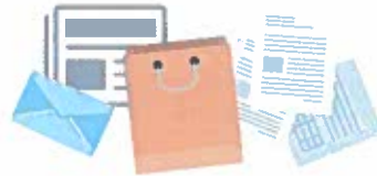
paper, newspaper, paper bags, magazines, envelopes, flyers and books