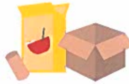
cardboard, paperboard and tubes