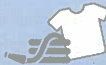
hoses, ropes and textiles