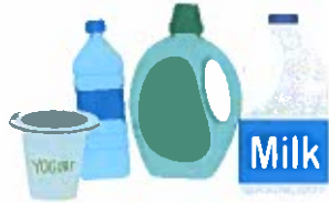
rigid plastic containers #1 - 7