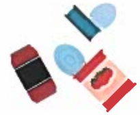
metal cans, pots and pans