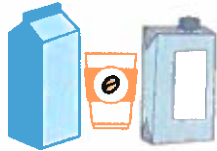
paper coffee cups and milk, juice, dairy-free milk and broth cartons