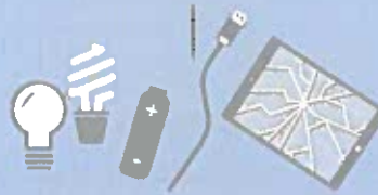
light bulbs, batteries or electronics