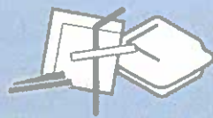
to-go lids, styrofoam, straws and napkins