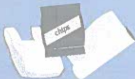
plastic bags, bubble wrap or plastic wrap