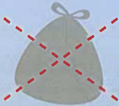
bagged recyclables or trash