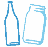
glass jars and bottles