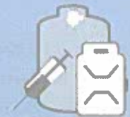
sharps, knives or propane tanks